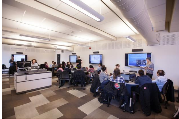
Figure 1. Side view of an Active Learning Classroom.