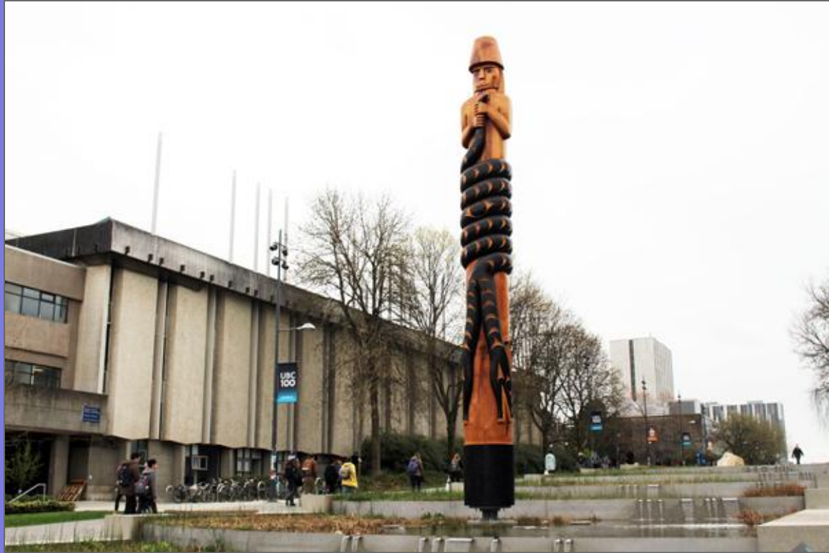
Musqueam sʔi:qəy̓ qəqən (double-headed serpent post), UBC Point Grey Campus